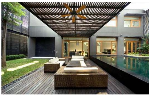
Fig: Water pond is provided at courtyard along with sitting area. Due to water pond, cool braze and southing climate is created at residential unit,