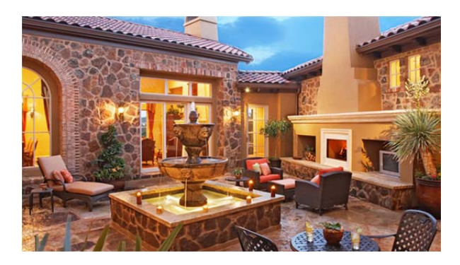
Fig:Contempary residential unit fire place. This will be the gathering space.

Old Maharastrian Residential unit is divided into different spaces like Padavi, Oota, Maajghar, courtyard etc. But, in contempary design these spaces are converted as Poarch, Entrance lobby, Family Lounge, Atrium etc.