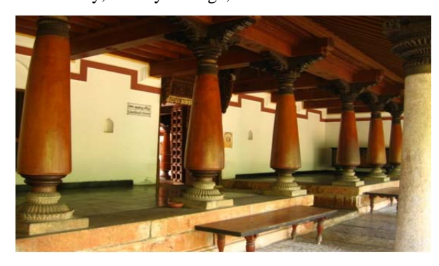
Fig.: PADAVI 1

Old Maharastrian Residential unit is divided into different spaces like Padavi, Oota, Maajghar, courtyard etc. But, in contempary design these spaces are converted as Poarch, Entrance lobby, Family Lounge, Atrium etc.