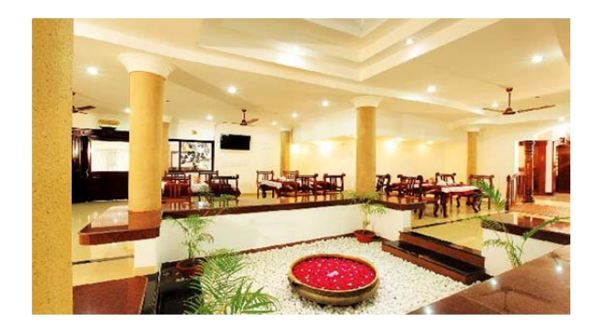
Fig: Different habitable area surrounded by courtyard