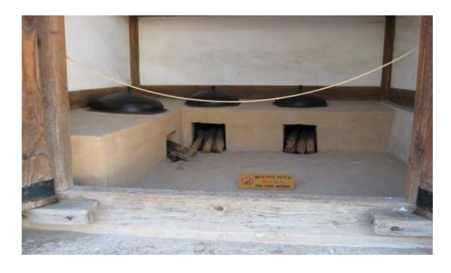
Fig: In village settlement fire place was provided at the Varandha, so when main lady of the home will prepare food all other family member will sit around and chat with each other. It will be family gathering place.