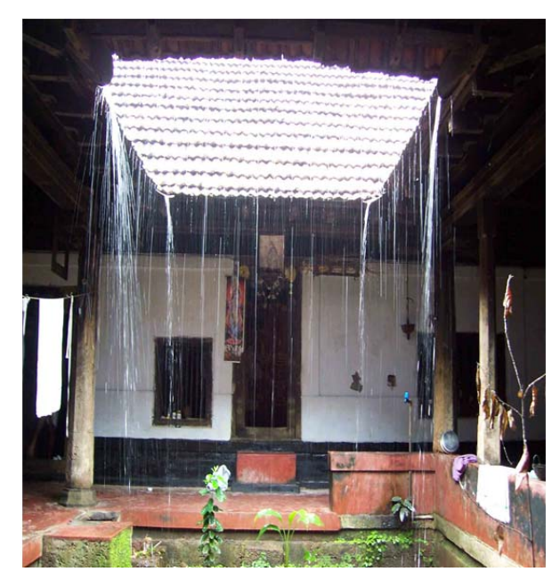
Fig. : Sometime used for rain harvesting

Courtyard is used for various purposes. Like to child bath, dry grain, Family functions, family interaction space, house hold works.