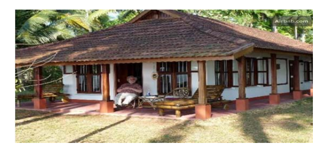
Fig: PADAVI 2