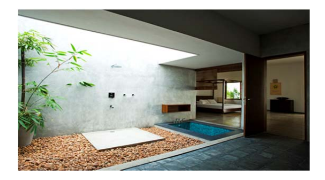
Fig: Open air bathroom