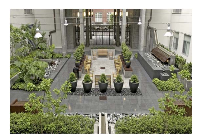
Fig: Open courtyard

An internal courtyard opens into the street through a welcoming portal, which provides a graceful transition from the public realm of the street to the more private atmosphere of the courtyard.