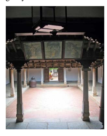
Fig.: Rural House at Kerla

surrounded by rooms with the front wall windows less the entrance in side galleys and bath rooms in most of houses.